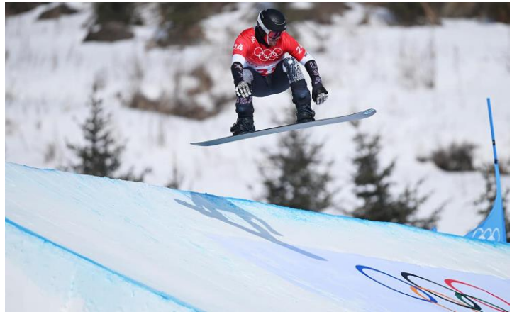
Mick Dierdorff, 2022

Belle Brockhoff – Australia Jarryd Hughes – Australia Belle Brockhoff – Russia Esther Ledecka – Czech Republic